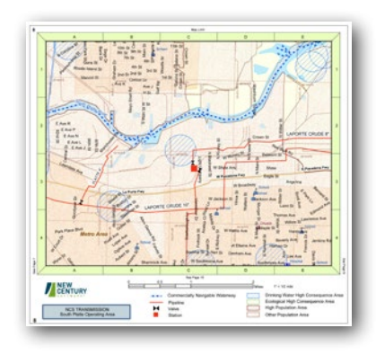
SheetCutter can be used to create area maps for oil and gas pipelines.

SheetCutter is an ArcGIS extension used to produce alignment sheets from a pipeline database.